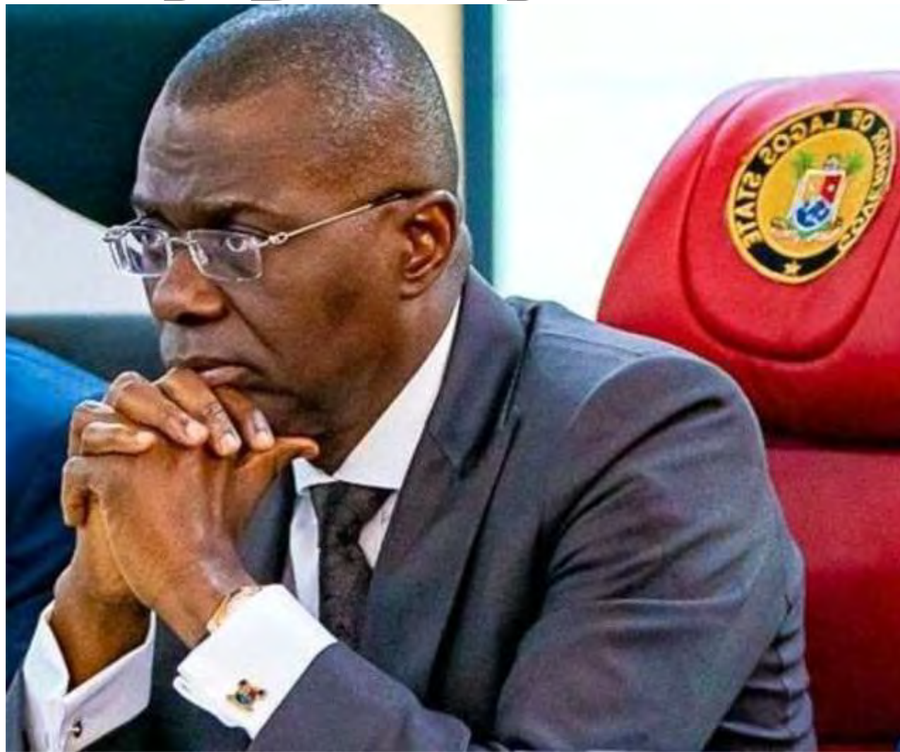
Gov. Babajide Sanwo-Olu

the use of tobacco, it only regulates it by restricting the places where it can be used. There are criminal sanctions for non-