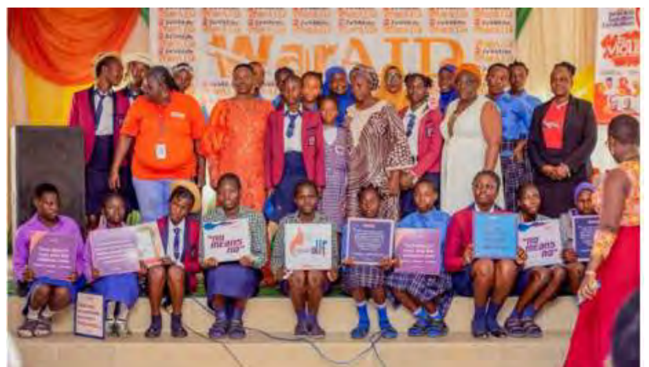
(The WARAID members with some pupils after a successful exhibition against women and child violence )

Several schools, including Robinson Group of School, Ashapa, Seme-Badagry, Faithful City Mission School, and Master Hand Academy, participated in the event.