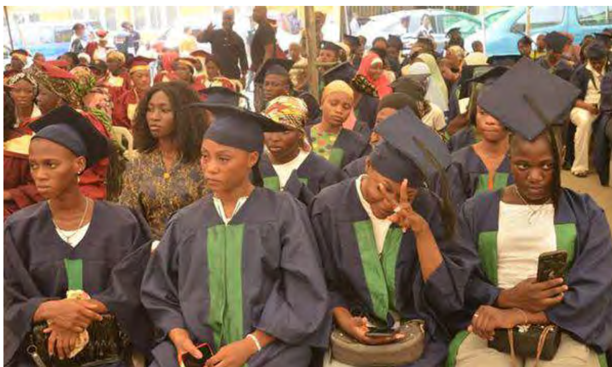
(Cross section of the recently graduands of the Mushin LG Skill Acquisition Center )

O ver 200 young individuals have been empowered with valuable skills and